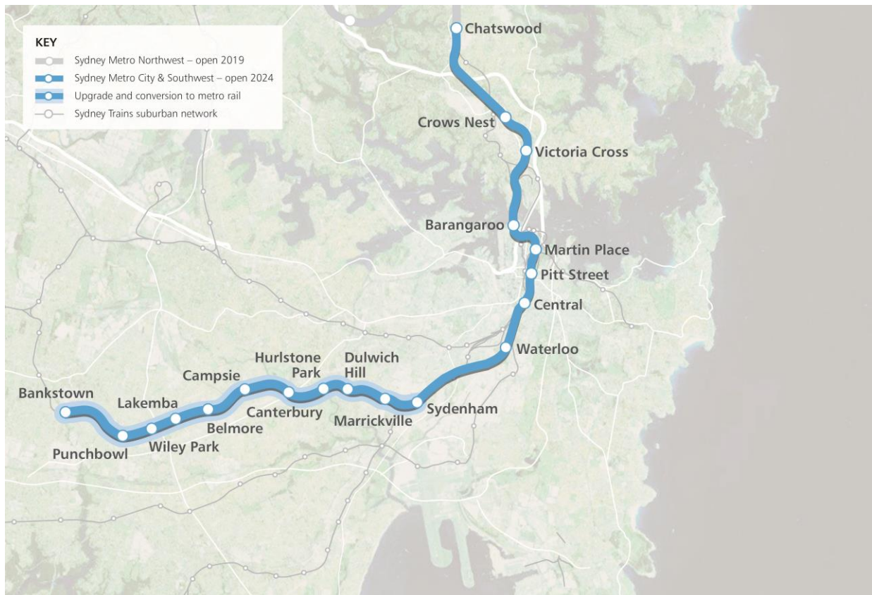
Figure 1: The project